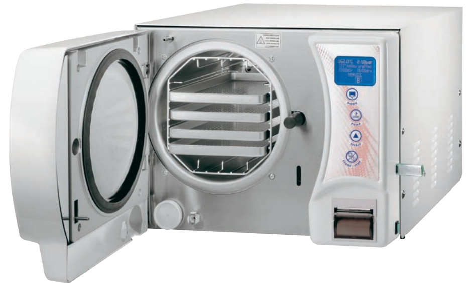
18 Litre Model with Data Logger

Printer – A data printer is fitted as standard to all models.