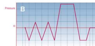
Class "B" - Fractionated vacuum