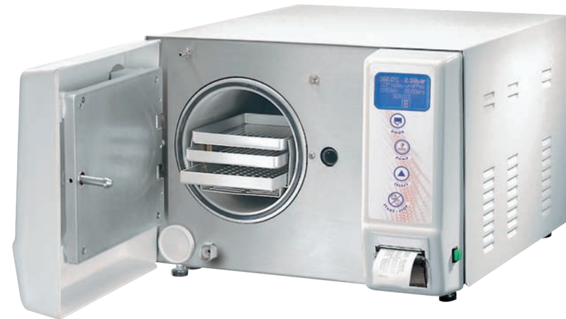
6 Litre Model

LTE is a progressive company and reserves the right to alter the specification of its products without notice. E&OE