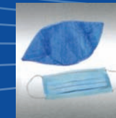
Small porous loads