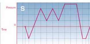
Class "S" - Pre and Post vacuum